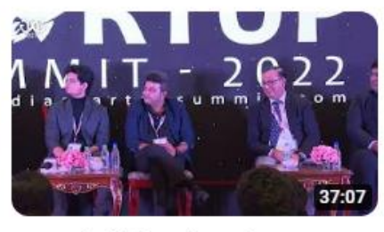
How to build the culture of a Company? Human Capital and it's...